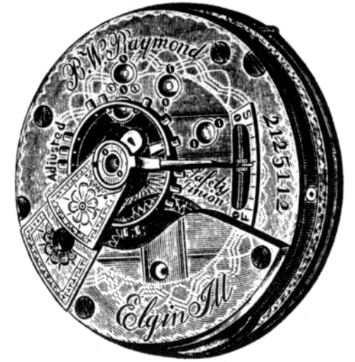
THE "B. W. RAYMOND" MOVEMENT.

Based on the Elgin Factory Grade Number Classification System